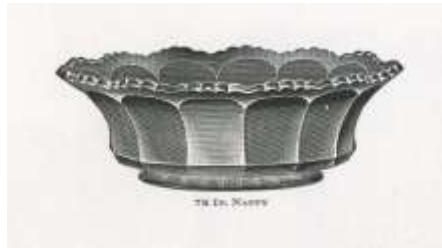
400 Colonial Scalloped Top