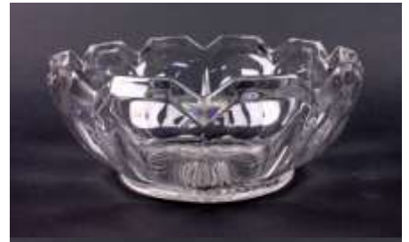
421 Prism Block