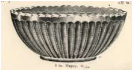
9 Single Row Slash & Panel