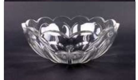
341 Puritan (Old Williamsburg)