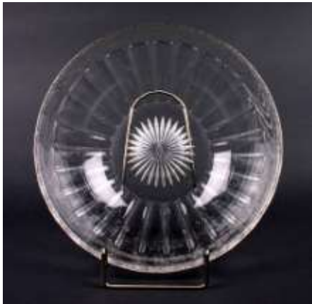
393½ Narrow Flute