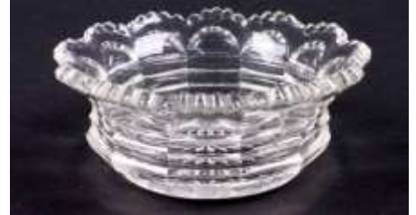
357 Prison Stripe