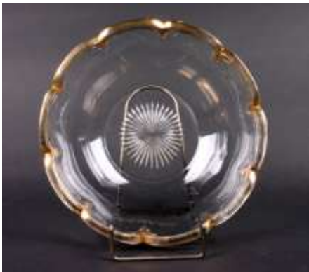
397 Colonial Cupped Scallop