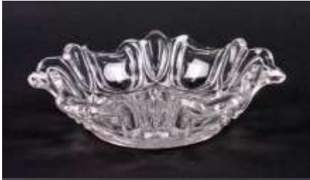
365 Queen Anne