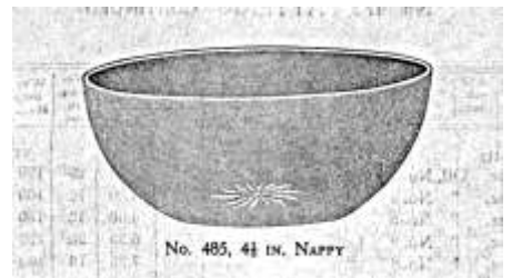
485 Dunham (also used in 1183 Revere)