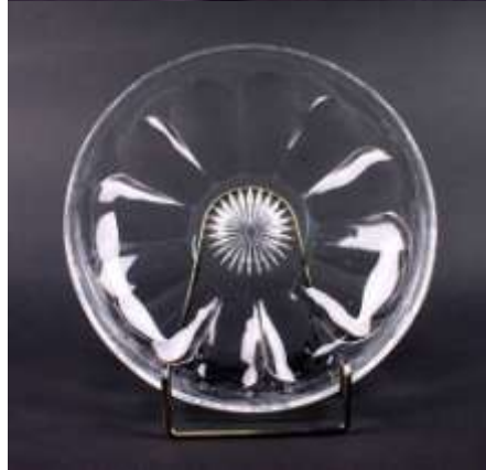
352 Flat Panel