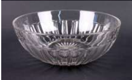
465 Recessed Panel