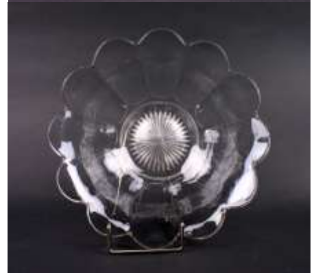
331 Colonial Panel