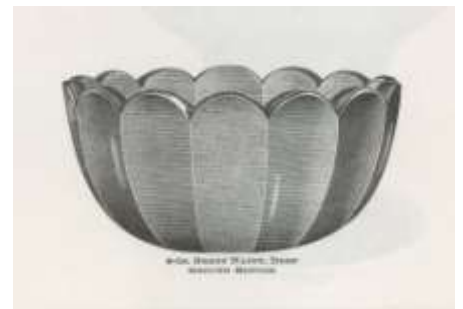
353 Medium Flat Panel