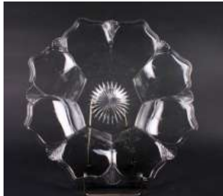
380 Scalloped Octagon