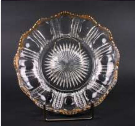
315 Paneled Cane