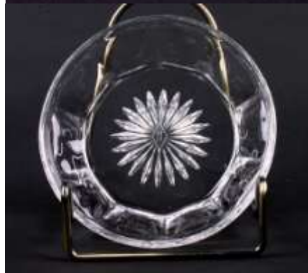
1174 Colonial Star