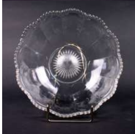
400½ Colonial Scalloped Top