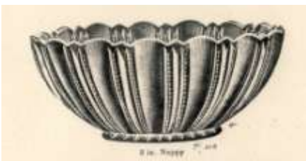
12 Double Row Slash & Panel