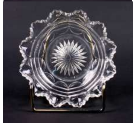
357½ Prison Stripe