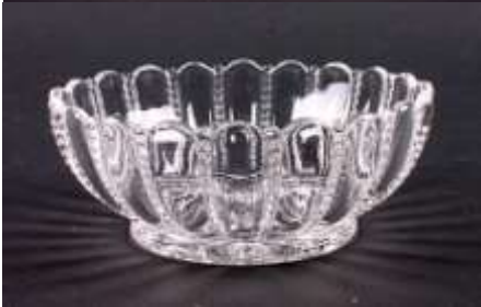
8 Vertical Bead & Panel