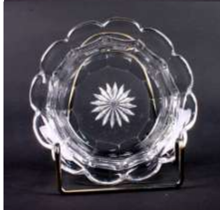
461 Convex Circle