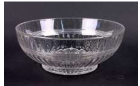
150 Banded Flute