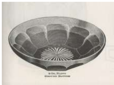
354 Wide Flat Panel