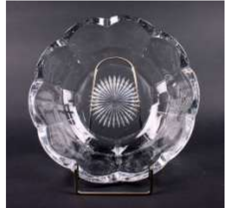
429 Plain Panel Recess